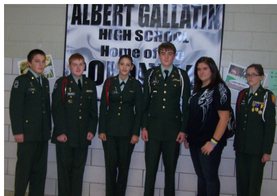
Albert Gallatin Colonial Battalion 2012 Academic Team