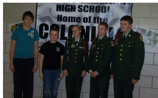
Albert Gallatin Colonial Battalion 2012 Leadership Team

The team worked hard and competed well, but were disappointed that they did not score high enough to make it to round two of the competition.